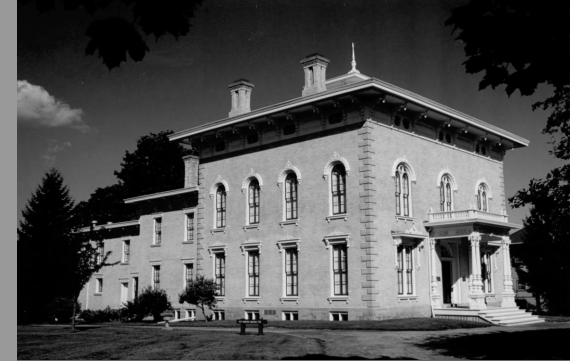
The historic Lincoln-Tallman House is the only existing private residence in Wisconsin where Abraham Lincoln slept.