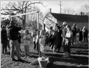
RCHS volunteers create a magical Halloween each October during Snap Apple Night.